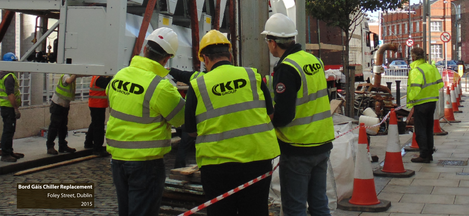
Bord Gáis Chiller Replacement Foley Street, Dublin 2015