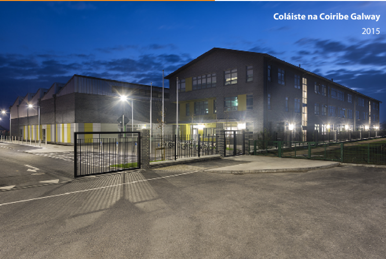
Coláiste na Coiribe Galway 2015