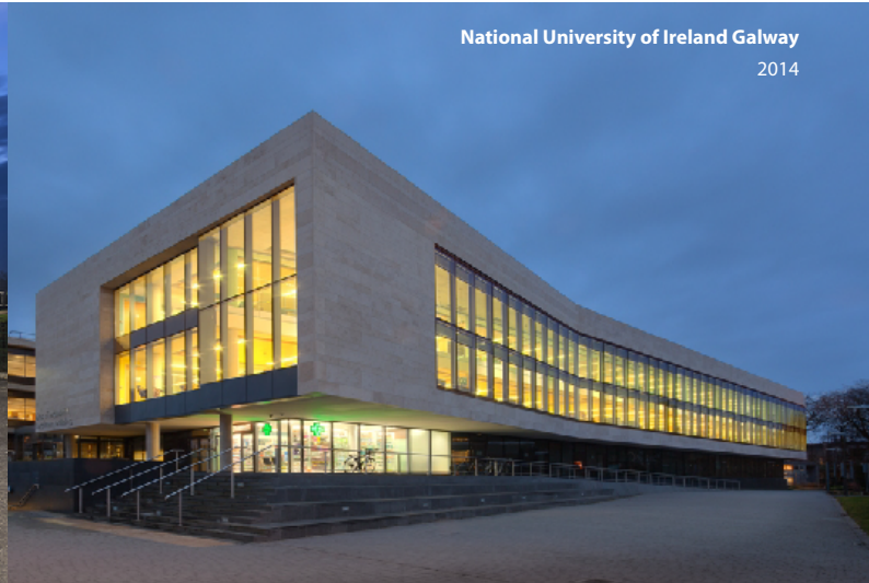
National University of Ireland Galway 2014