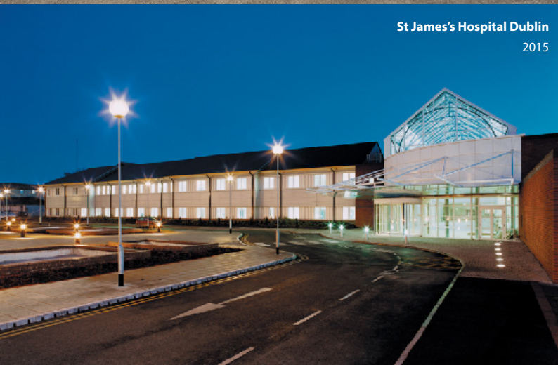
St James's Hospital Dublin 2015