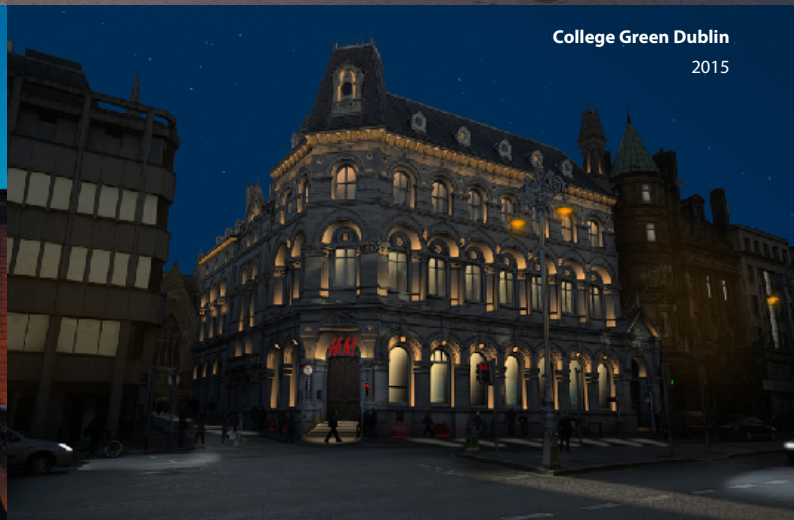
College Green Dublin 2015